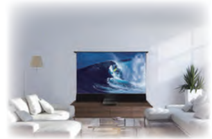
Hidden into the floor or placing.