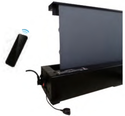
Built-in 868MHz wireless Control