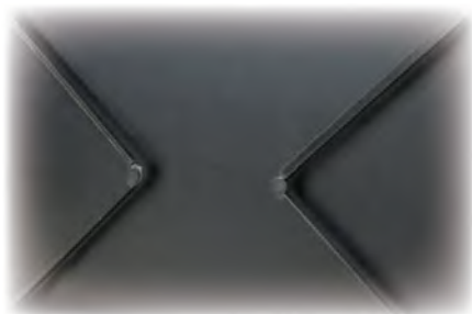
Double v-shaped structure bracket

Screen is with 3D nano coating which combines the contrast and gain perfectly reaching 20000:1 cinema standard. With a nearly perfect viewing angle of 178° and big size range (100"-120"), it is capable of being viewed from extreme off axis positions even during day time with ambient light. When compared with normal matte white screen and other ALR fabric, the picture comes alive and maintains the contrast of the projector.