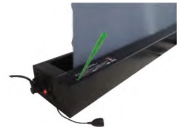
Up & down limit adjustment Anti-pinch hand device